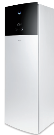
Integrated model with domestic hot water EAV(H/X/Z)-D