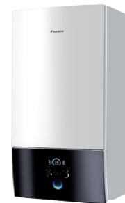
Wall mounted model EABH(X)-D