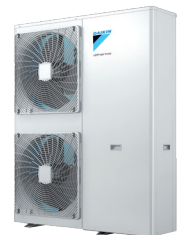
Outdoor unit EPGA-DV